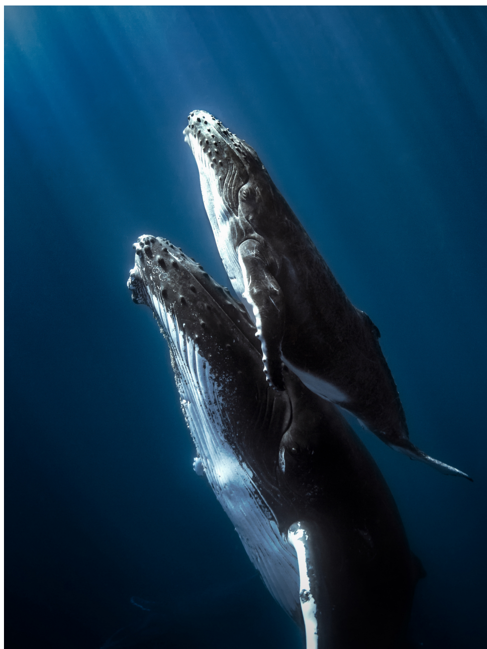
Humpback whale mother and calf

Focusing on conservation issues and their solutions, students from all corners of the world will share ideas and stories whilst making friends with different communities. So far, we have schools in Thailand, Uganda and Kenya with many more to come.