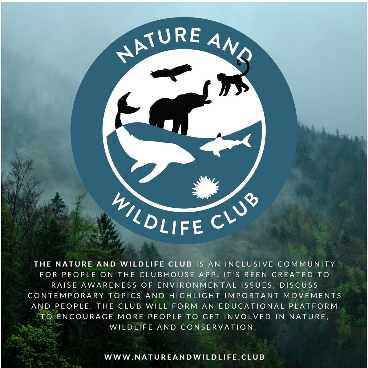
Poster for 'Nature and Wildlife Club' on the ClubHouse app

Our friends over in Kenya have been distributing face masks to their Nature Guardians Students . Through the help of the Kwale Plastics Plus Collectors, the team at Conservation Education Society have been ensuring that local communities can continue to learn, help the environment and be inspired all in a safe manner. This month alone they have been able to distribute over 500 masks!