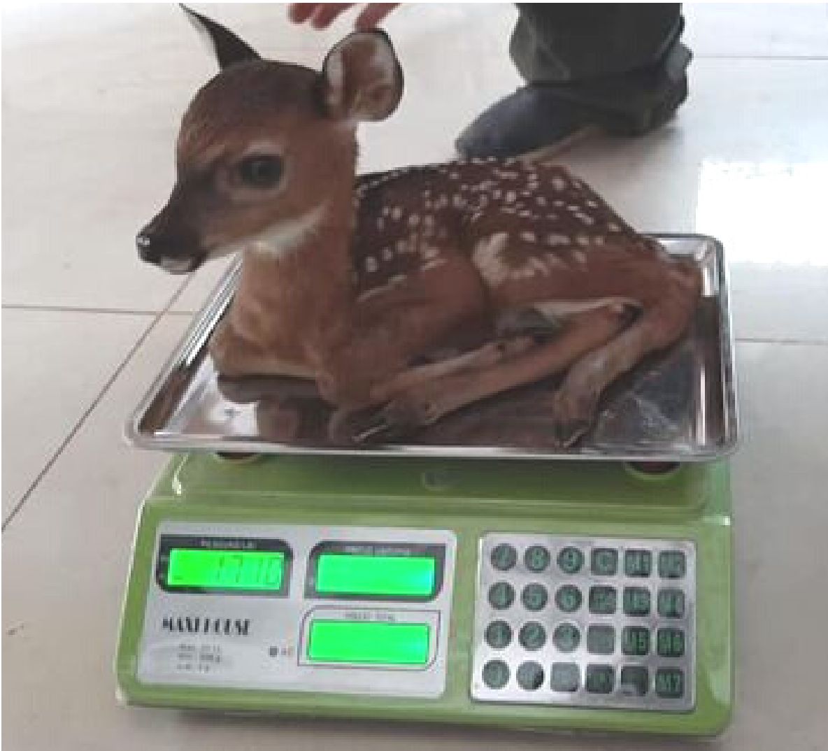
Rescued white-tailed deer fawn

Over in Costa Rica the Rescue Centre team have been busy as usual rescuing and treating injured or orphaned animals . From sloths to parrots, every animal is treated with love and care. A recent casualty, and perhaps one of the cutest, is this white-tailed deer fawn (see picture), which is also Costa Rica's national animal. Unfortunately, the baby lost his mother in a forest fire . The team are getting him up to full strength to he can enjoy the rest of his life in peace.