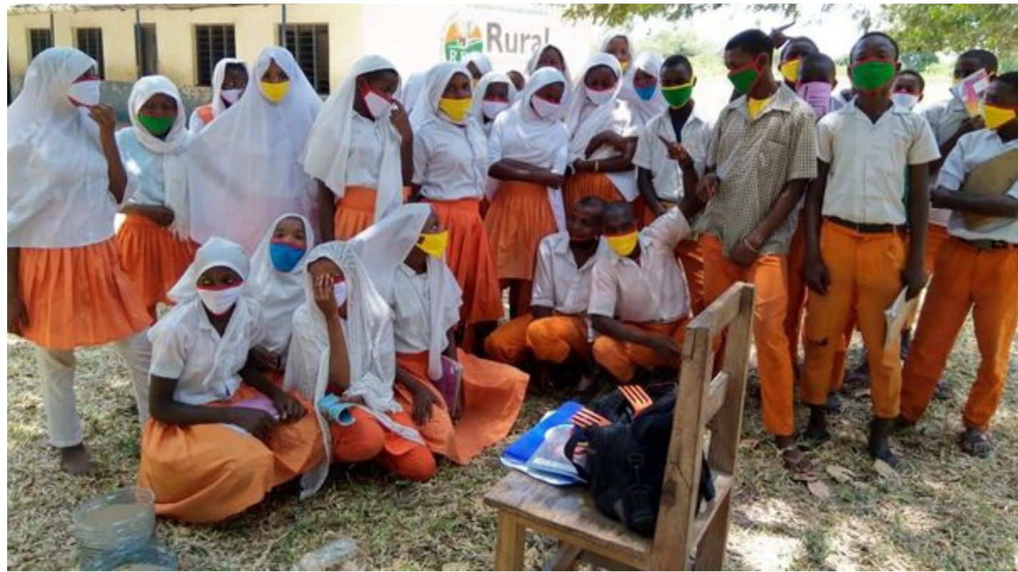
Students in Kenya wearing the masks that have been donated to them

Over in Costa Rica the Rescue Centre team have been busy as usual rescuing and treating injured or orphaned animals . From sloths to parrots, every animal is treated with love and care. A recent casualty, and perhaps one of the cutest, is this white-tailed deer fawn (see picture), which is also Costa Rica's national animal. Unfortunately, the baby lost his mother in a forest fire . The team are getting him up to full strength to he can enjoy the rest of his life in peace.