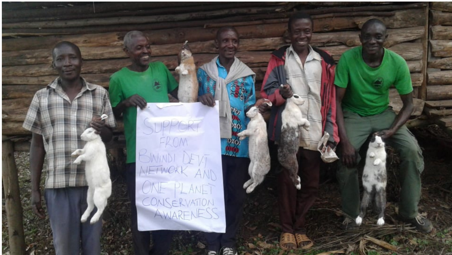
Members of the Bwindi community with the farmed rabbits

We are proud to start of our network round-up with news from the Bwindi Development Network. Last summer OPCA managed to raise just over £1,000 for our friends over in Uganda. Some of this money was used to breed rabbits (free range and well looked after). These rabbits are now been distributed amongst local families in the community . Providing a sustainable source of fertiliser and meat so that local families don't have to rely on hunting bush meat from the forests.