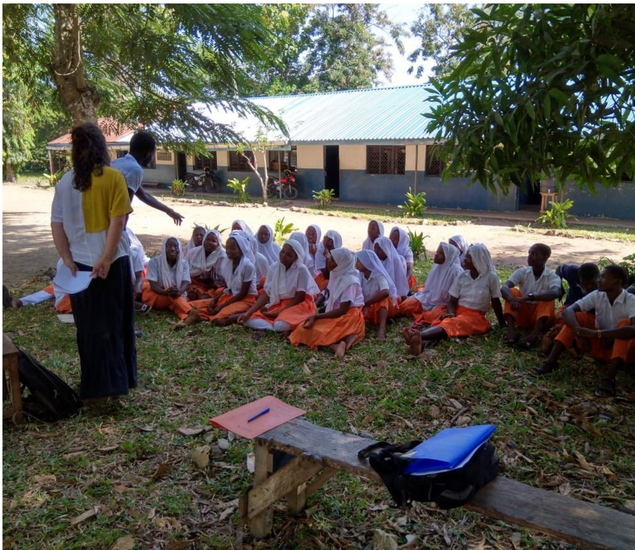
Students receiving a workshop in waste management

In Australia, the Wild Education team have started a new initiative called Wild Clean-up . Every second Sunday they will be hosting either a beach or nature clean up on Sydney's Northern Beaches . Anybody is welcome to join and help clean up the area. Wild education also encourage those that are not able to join, to get their own communities involved in Wild Clean-ups and share their experiences on their social media platforms.