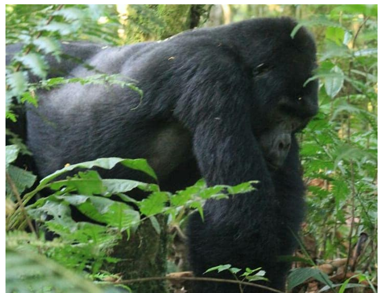
Mountain Gorilla in Bwindi Impenetrable National Park

Our friend Alex Ngabirano, founder of the Bwindi Development Network has been exploring how behavioural insights can be applied to complement and strengthen efforts aimed at tackling green corruption . Poaching is still a big problem across Africa, and the issue unfortunately sometimes reaches into the very authorities who are trying to stop it. Thankfully, BDN continue to work hard to put a stop to poaching across the Bwindi region, protecting the lives of mountain gorillas and other wildlife species.