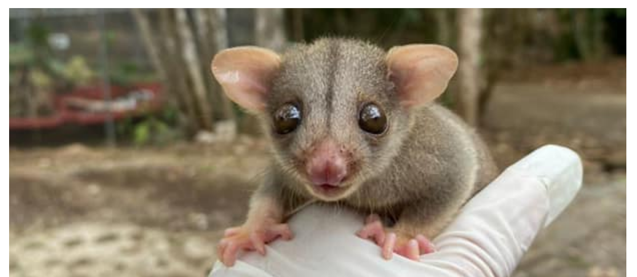
Gonzalo the woolly opossum

Over in Costa Rica, the rescue centre hosted students from the Universidad Nacional de Costa Rica, commonly known as UNA. These future veterinarians came to the rescue centre to study and learn about salmonella in primates . Important research that is sure to help primates across Costa Rica. As usual the rescue centre has also been busy taking care of orphaned baby animals like Gonzalo, a young woolly opossum who was bought in to the centre earlier this month.